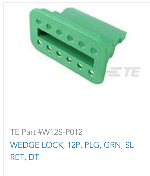
TE Part #W12S-P012 WEDGE LOCK, 12P, PLG, GRN, SL RET, DT