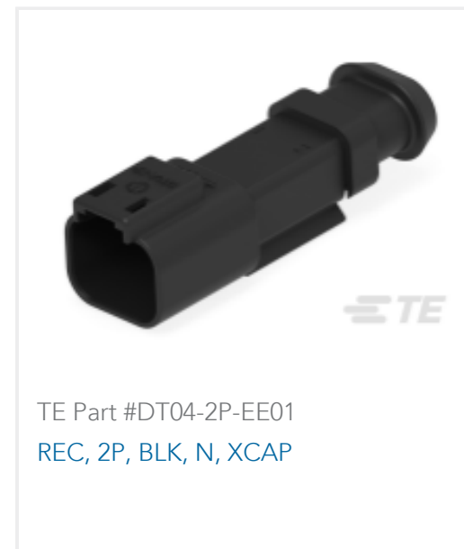
TE Part #DT04-2P-EE01 REC, 2P, BLK, N, XCAP