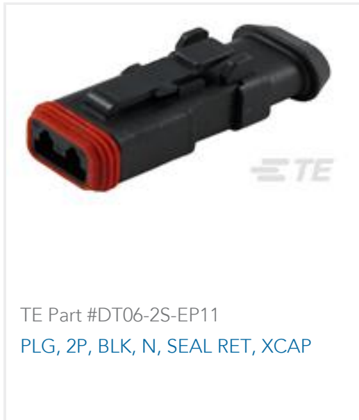
TE Part #DT06-2S-EP11 PLG, 2P, BLK, N, SEAL RET, XCAP