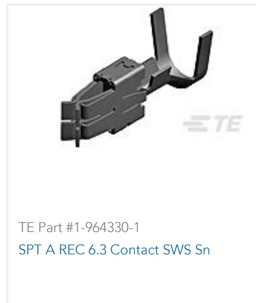
TE Part #1-964330-1 SPT A REC 6.3 Contact SWS Sn