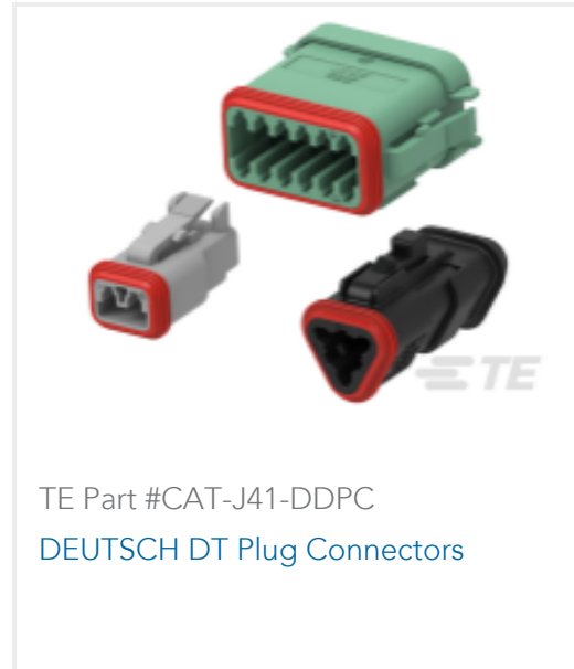
TE Part #CAT-J41-DDPC DEUTSCH DT Plug Connectors