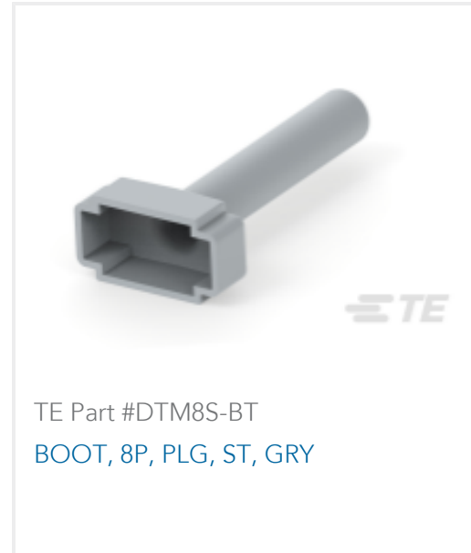
TE Part #DTM8S-BT BOOT, 8P, PLG, ST, GRY