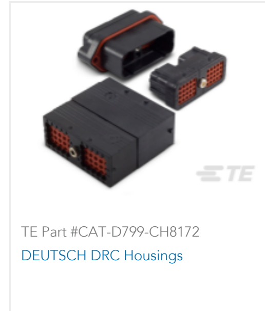
TE Part #CAT-D799-CH8172 DEUTSCH DRC Housings