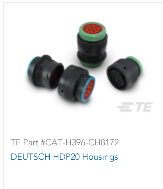
TE Part #CAT-H396-CH8172 DEUTSCH HDP20 Housings