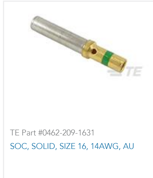
TE Part #0462-209-1631 SOC, SOLID, SIZE 16, 14AWG, AU