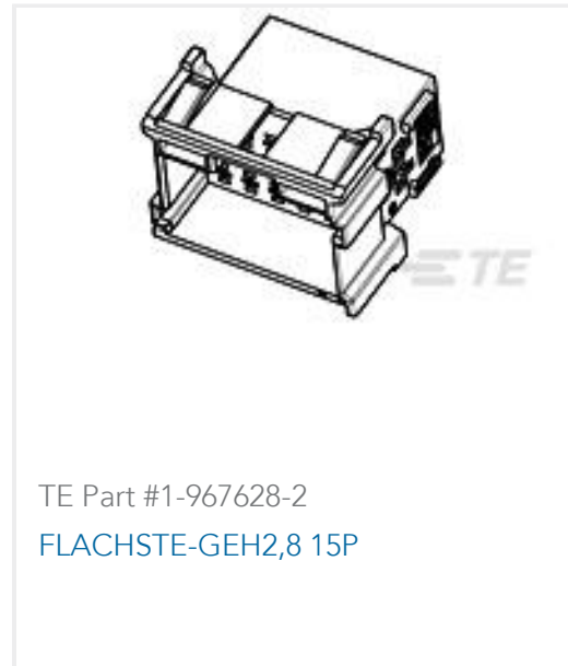
TE Part #1-967628-2 FLACHSTE-GEH2,8 15P