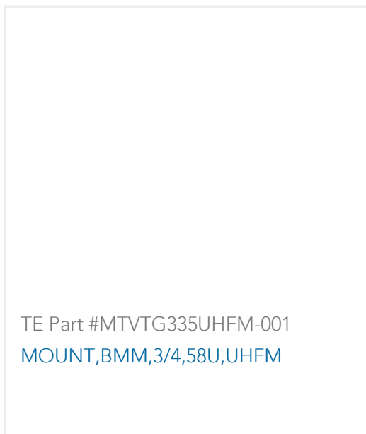
TE Part #MTVTG335UHFM-001 MOUNT, BMM, 3/4, 58U, UHFM