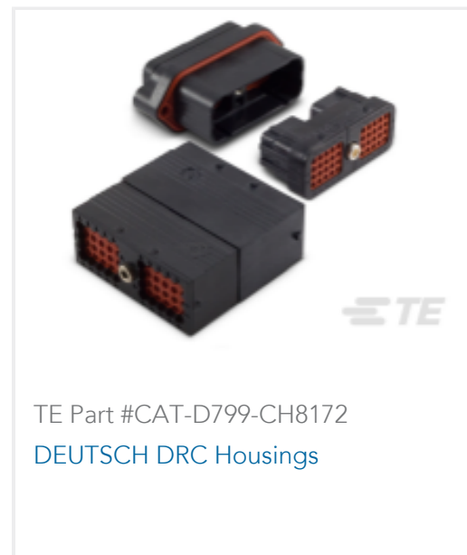
TE Part #CAT-D799-CH8172 DEUTSCH DRC Housings