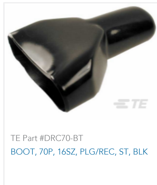
TE Part #DRC70-BT BOOT, 70P, 16SZ, PLG/REC, ST, BLK