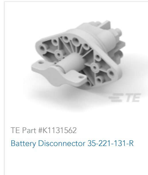
TE Part #K1131562 Battery Disconnecter 35-221-131-R