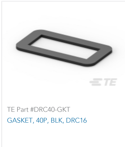
TE Part #DRC40-GKT GASKET, 40P, BLK, DRC16