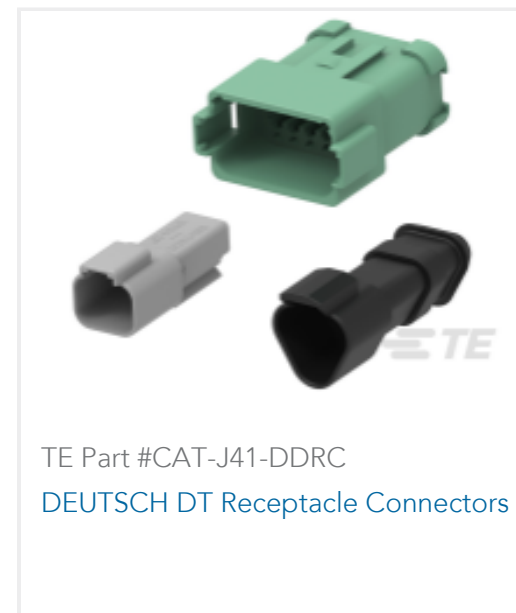
TE Part #CAT-J41-DDRC DEUTSCH DT Receptacle Connectors