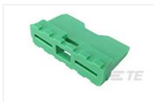
TE Part #W12P WEDGE LOCK, 12P, REC, GRN, DT