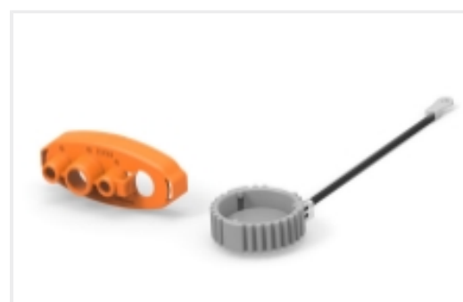
Connector Caps & Covers(1)