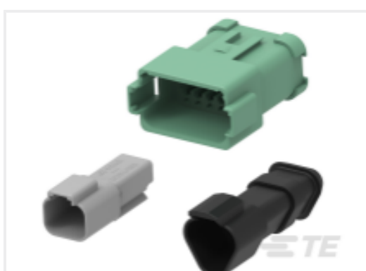
TE Part #CAT-J41-DDRC DEUTSCH DT Receptacle Connectors