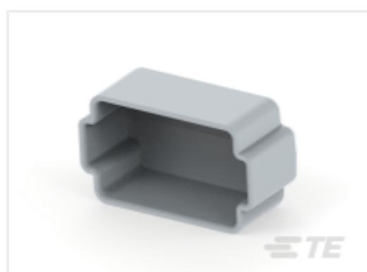
TE Part #DT12P-DC PROTECT CVR, 12P, REC, GRY, DT