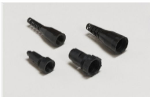
Connector Strain Relief(31)