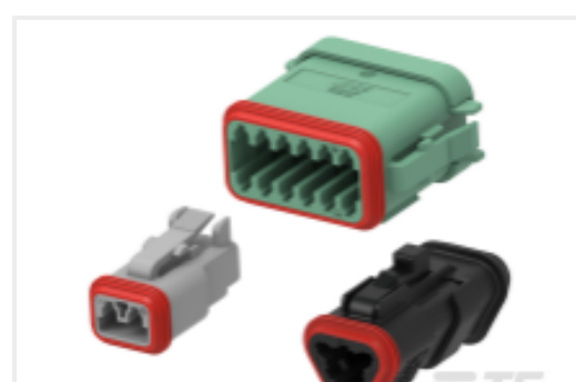
TE Part #CAT-J41-DDPC DEUTSCH DT Plug Connectors