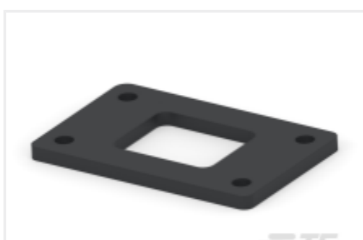
TE Part #DT8P-L012-GKT GASKET, 8P, BLK, DT/DTM