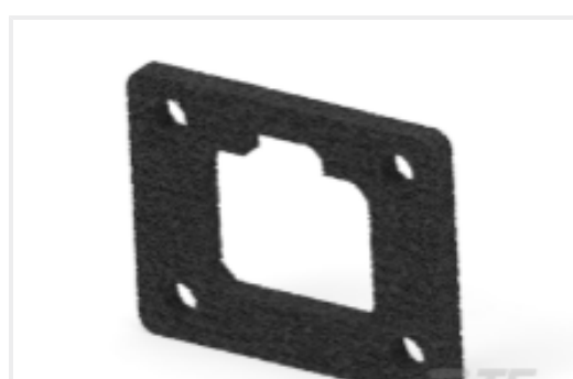
TE Part #DT4P-L012-GKT GASKET, 4P, BLK, DT/DTM