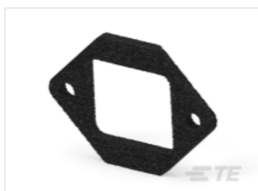
TE Part #DTP4P-L012-GKT GASKET, 4P, BLK, DTP