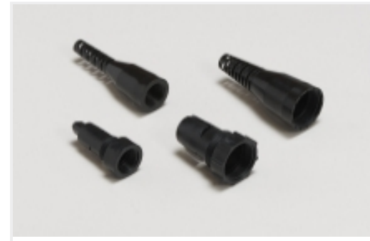
Connector Strain Relief(31)