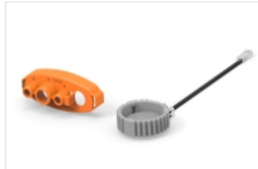
Connector Caps & Covers(1)