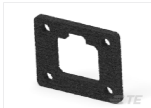
TE Part #DT4P-L012-GKT GASKET, 4P, BLK, DT/DTM