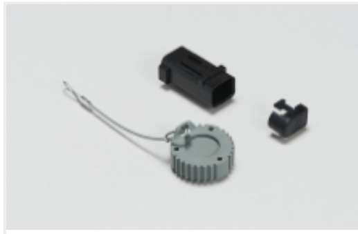
Automotive Connector Caps & Covers (19)