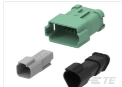
TE Part #CAT-J41-DDRC DEUTSCH DT Receptacle Connectors