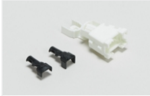
Rectangular Backshells & Clamps(3)