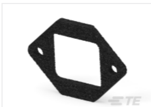
TE Part #DTP4P-L012-GKT GASKET, 4P, BLK, DTP