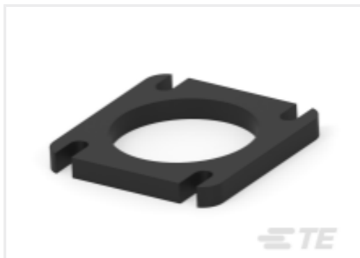
TE Part #HD10-3-GKT GASKET, 3SZ, BLK, HD10