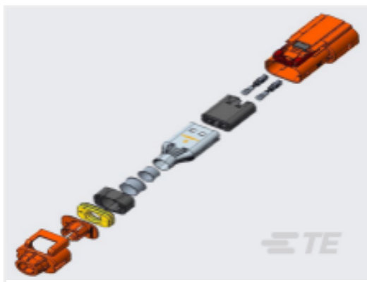
TE Part #YHV280-2PM-S-4MM-D HVA280-2phm,shunted,4sqmm,Key D