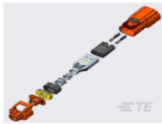
TE Part #YHV280-2PM-S-4MM-E HVA280-2phm,shunted,4sqmm,Key E