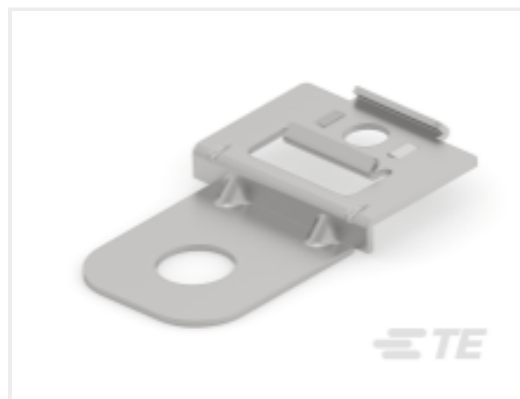
TE Part #1027-008-1200 CLIP, STEEL, ZINC, 11MM HOLE, SIDE