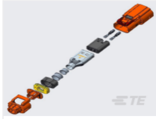
TE Part #YHV280-2PM-S-4MM-A HVA280-2PHM,SHUNTED,4SQMM, KEY A