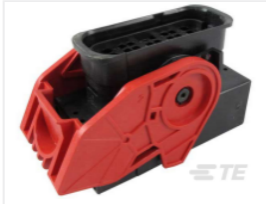
TE Part #SRK06-MDA-32A-001 PLG, 32P, BLK, E, A