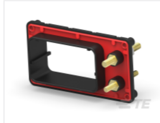
TE Part #YDRBM-3A0000000000 FLANGE, MOUNT, 102/128P, BLK, STUD, A