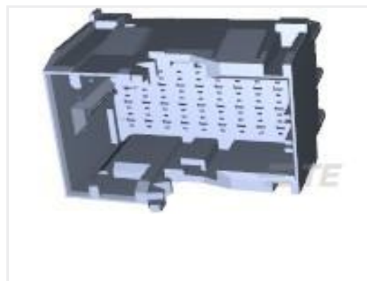
TE Part #1-1718492-2 1.5MM TAB HSG 36 POS ASSY