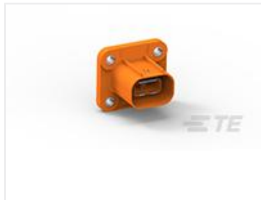
TE Part #2103124-1 HVA280 2P HEADER ASSY, KEY A