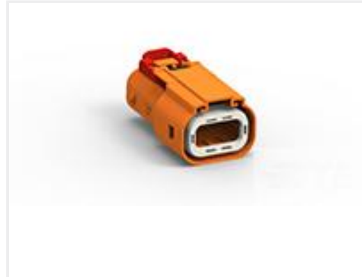
TE Part #4-2103015-4 PLUG SUBASSY, D, HVA280-2PHM F