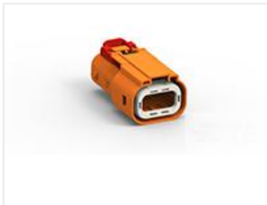
TE Part #4-2103015-5 PLUG SUBASSY, E, HVA280-2PHM F