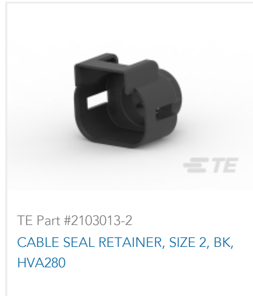
TE Part #2103013-2 CABLE SEAL RETAINER, SIZE 2, BK, HVA280