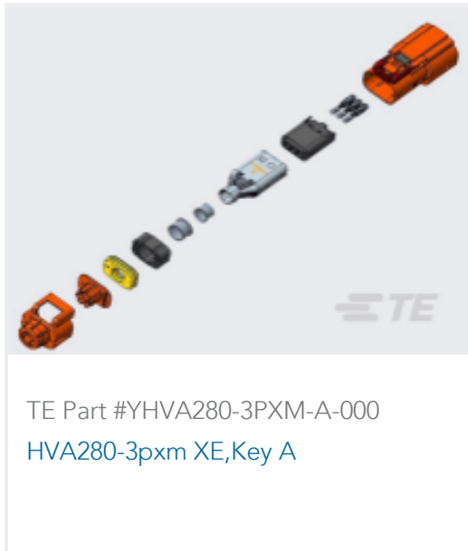
TE Part #YHVA280-3PXM-A-000 HVA280-3pxm XE,Key A