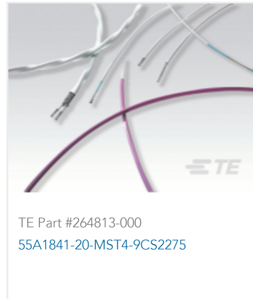
TE Part #264813-000 55A1841-20-MST4-9CS2275