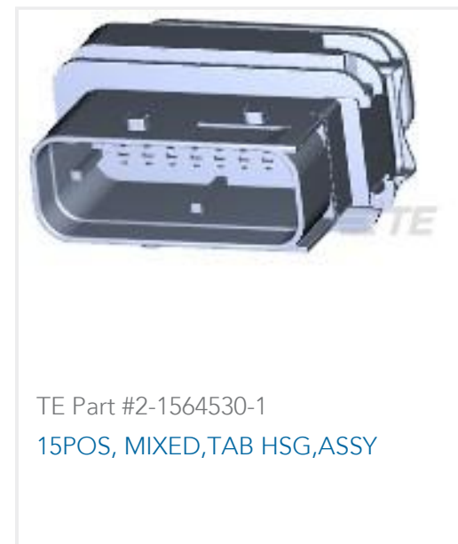
TE Part #2-1564530-1 15POS, MIXED,TAB HSG,ASSY