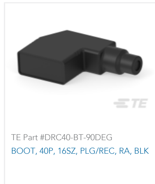
TE Part #DRC40-BT-90DEG BOOT, 40P, 16SZ, PLG/REC, RA, BLK