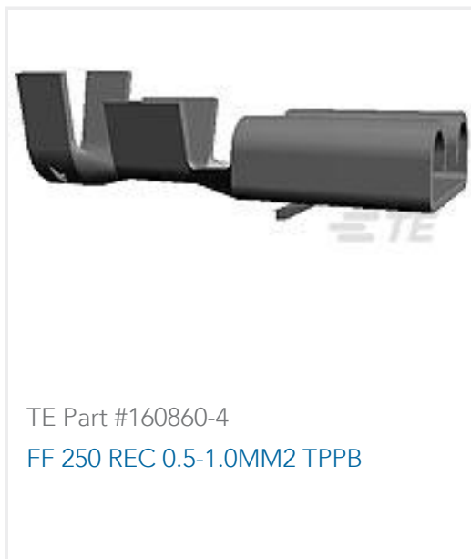
TE Part #160860-4 FF 250 REC 0.5-1.0MM2 TPPB