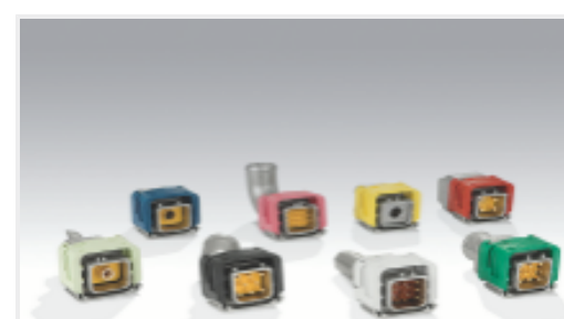
TE Part #ZPF000000000100828 DMC-MD 20 A