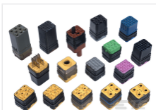
TE Part #ZPF00000000015318 DMC-M 20-22 SN