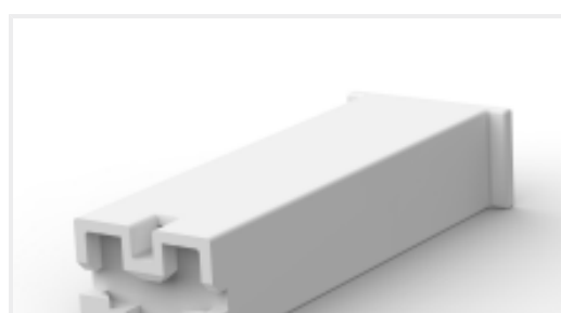
TE Part #928083-1 PL 187 REC HSG 1P NYLON NAT