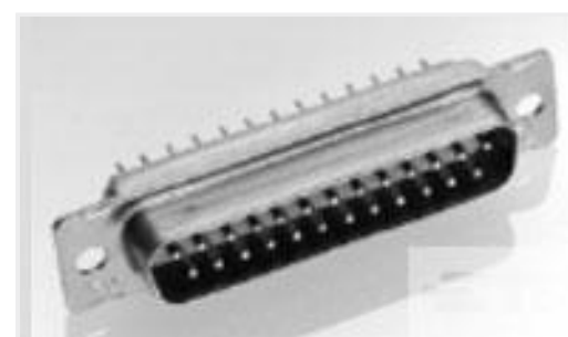
TE Part #1-1757823-0 AMPLIMITE,ASY,PLUG,STD,90,ZN,4,CT