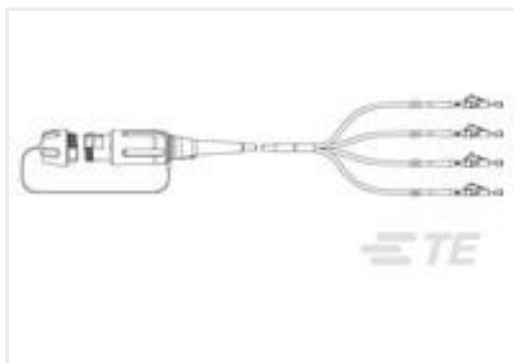
TE Part #1516526-1 FOCA,4F,PBJ PLUG/LC,OM3,MILTACT