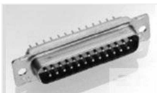
TE Part #1-1757823-1 AMPLIMITE,ASY,PLUG,STD,90,ZN,5,CT