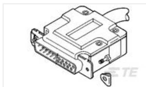
TE Part #5207908-1 STRAIN RELIEF W/SCREW RET KIT