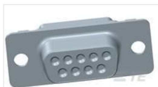
TE Part #205161-5 AMPLIMITE,ASY,RCPT,109,1