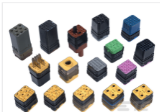
TE Part #ZPF00000000015299 DMC-M 20-22 BN