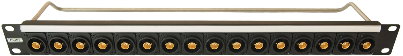
CP30186 - 1U Panel loaded with 16 x Gold BNC 75Ω 12GHz, M3 Holes. Front mounted

For further information, contact sales@cliffuk.co.uk