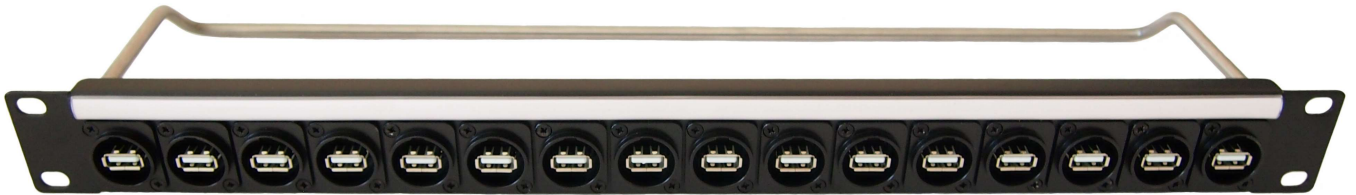
CP30175 - 1U Panel loaded with 16 x USB2 A-B Connectors. M3 Holes. Front mounted