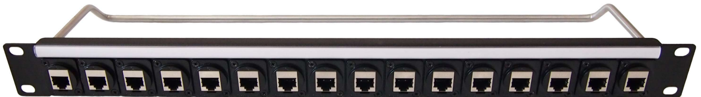
CP30177 - 1U Panel loaded with 16 x CAT6A Connectors. M3 Holes. Front mounted