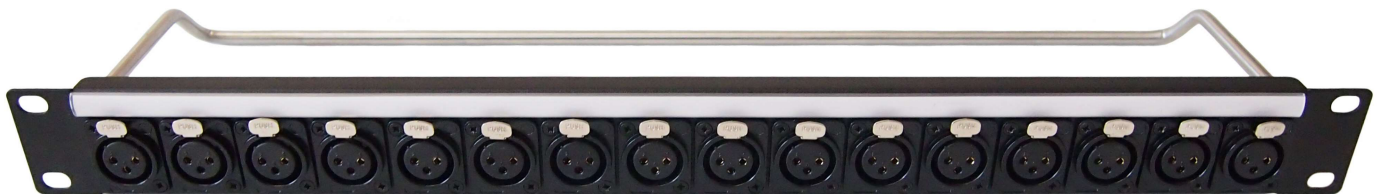
CP30182 - 1U Panel loaded with 16 x XLR 3DCF . M3 Holes. Front mounted. Solder tag at rear.