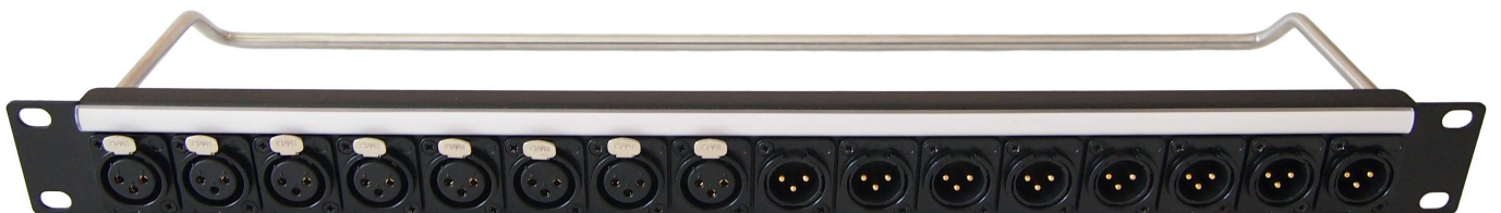
CP30183 - 1U Panel loaded with 8 x XLR 3DCF + 8 x XLR 3DCM. M3 Holes. Front mounted. Solder tag.