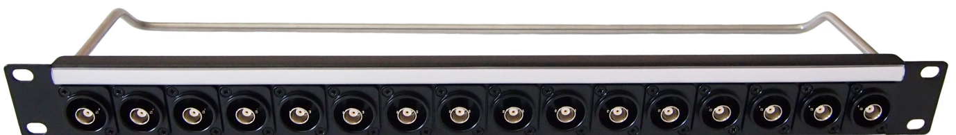
CP30184 - 1U Panel loaded with 16 x 50Ω Insulated BNC Connectors. M3 Holes. Front mounted