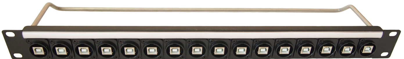
CP30176 - 1U Panel loaded with 16 x USB2 B-A Connectors. M3 Holes. Front mounted