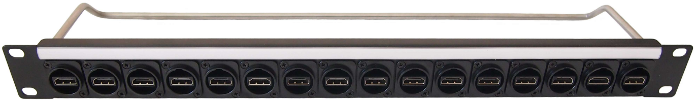
CP30174 - 1U Panel loaded with 16 x HDMI A-A Connectors. M3 Holes. Front mounted