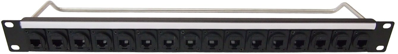
CP30172 - 1U Panel loaded with 16 x CAT6 RJ45 Connectors. #4-40 holes. Front mounted CP30173 - 1U Panel loaded with 16 x CAT6 RJ45 Connectors. M3 holes. Front mounted