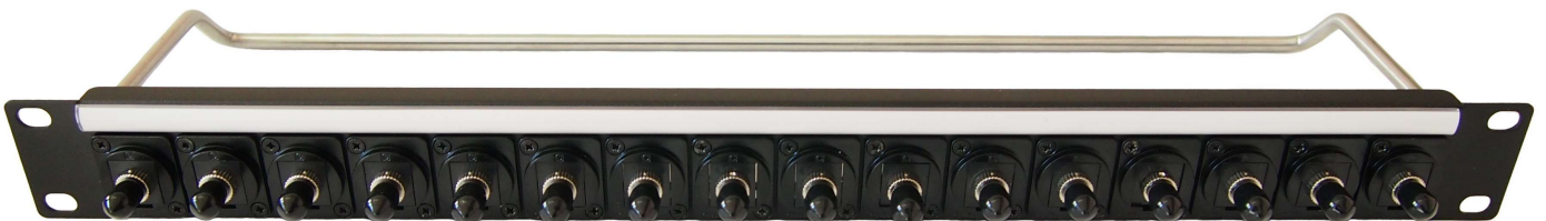
CP30178 - 1U Panel loaded with 16 x ST Fibre Connectors. M3 Holes. Front mounted