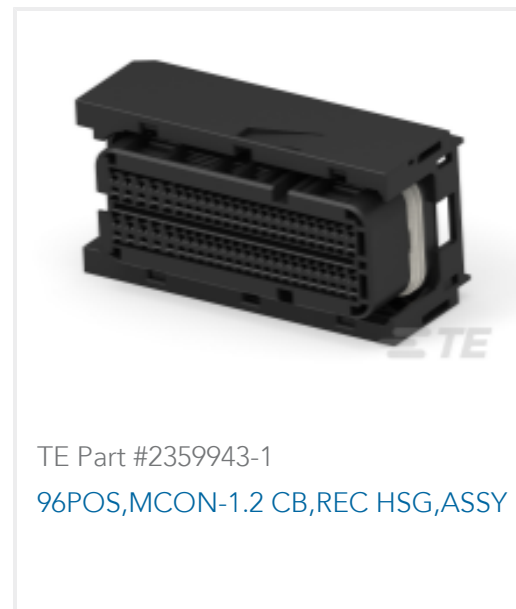
TE Part #2359943-1 96POS,MCON-1.2 CB,REC HSG,ASSY