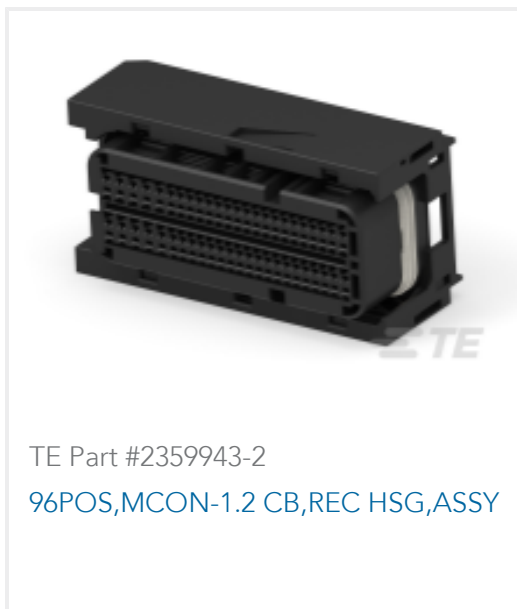
TE Part #2359943-2 96POS,MCON-1.2 CB,REC HSG,ASSY