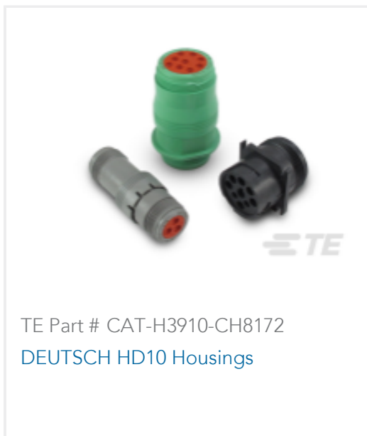
TE Part # CAT-H3910-CH8172 DEUTSCH HD10 Housings