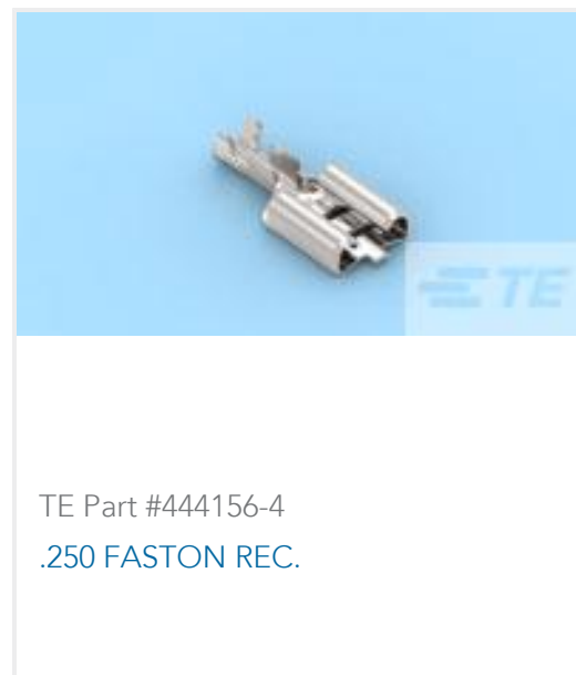
TE Part #444156-4 .250 FASTON REC.