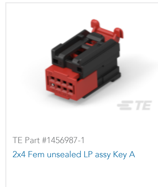
TE Part #1456987-1 2x4 Fem unsealed LP assy Key A