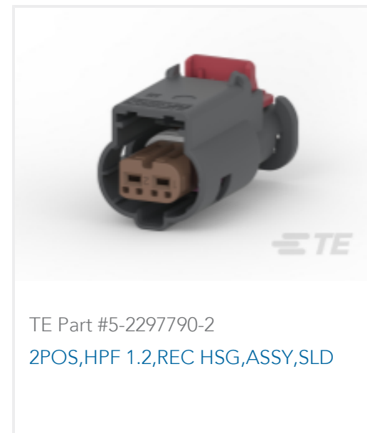
TE Part #5-2297790-2 2POS,HPF 1.2,REC HSG,ASSY,SLD