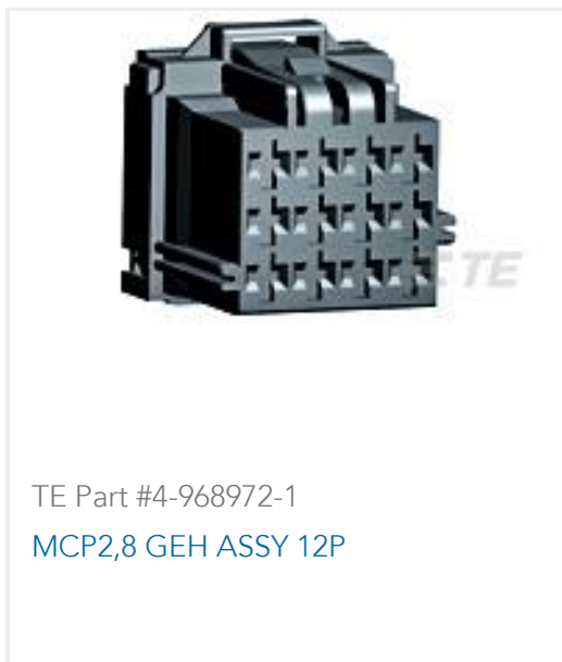
TE Part #4-968972-1 MCP2,8 GEH ASSY 12P