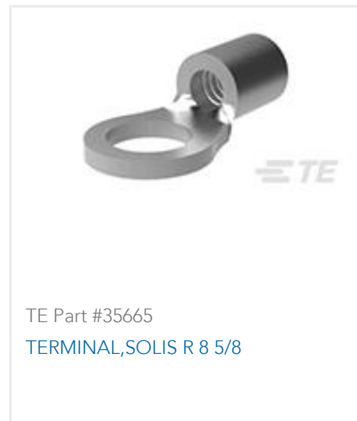
TE Part #35665 TERMINAL,SOLIS R 8 5/8