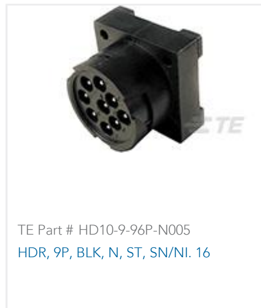
TE Part # HD10-9-96P-N005 HDR, 9P, BLK, N, ST, SN/NI. 16