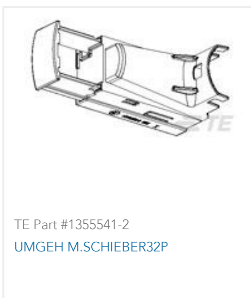
TE Part #1355541-2 UMGH M.SCHIEBER32P