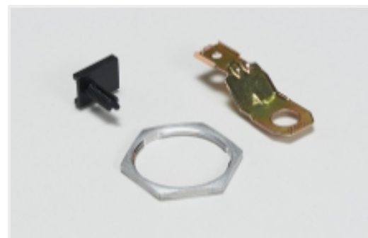
Other Automotive Connector Accessories(6)