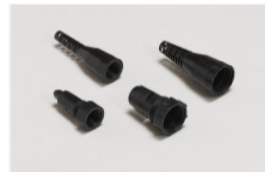
Connector Strain Relief(5)