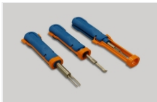
Insertion & Extraction Tools(11)