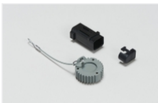
Automotive Connector Caps & Covers (4)