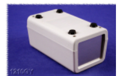
Upside Down View