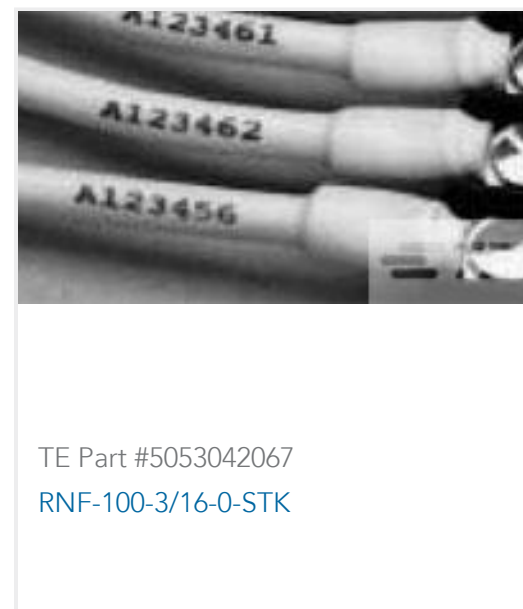
TE Part #5053042067 RNF-100-3/16-0-STK