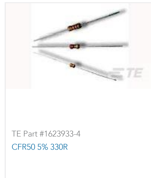
TE Part #1623933-4 CFR50 5% 330R