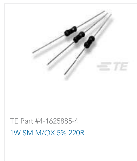
TE Part #4-1625885-4 1W SM M/OX 5% 220R