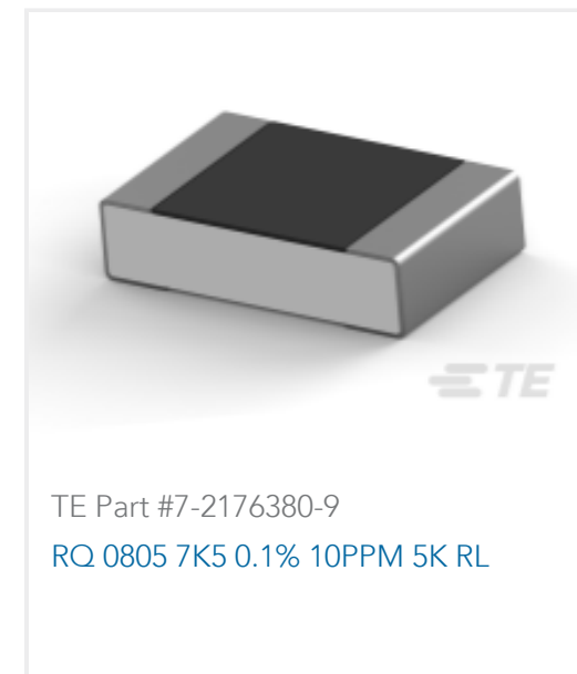
TE Part #7-2176380-9 RQ 0805 7K5 0.1% 10PPM 5K RL