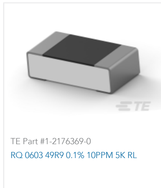
TE Part #1-2176369-0 RQ 0603 49R9 0.1% 10PPM 5K RL