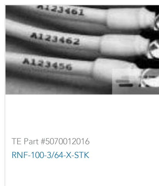
TE Part #5070012016 RNF-100-3/64-X-STK