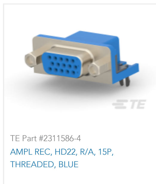
TE Part #2311586-4 AMPL REC, HD22, R/A, 15P, THREADED, BLUE