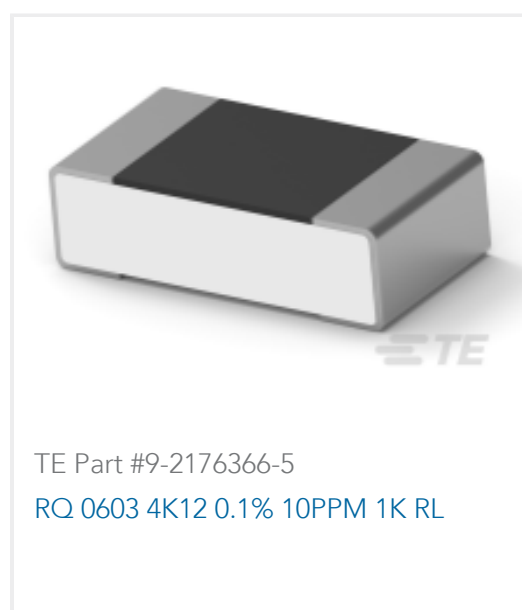
TE Part #9-2176366-5 RQ 0603 4K12 0.1% 10PPM 1K RL