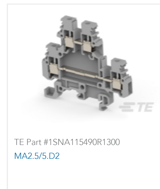
TE Part #1SNA115490R1300 MA2.5/5.D2