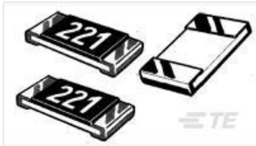
TE Part #2-2176070-0 3521 62R 1% 2W