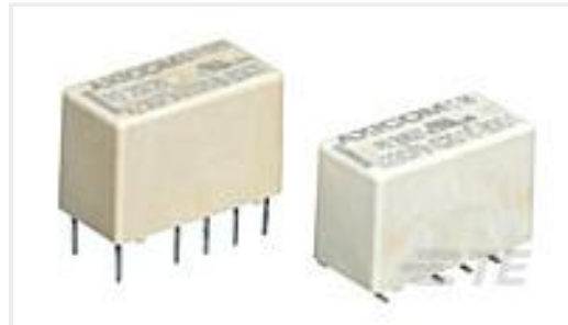
TE Part #6-1393788-9 V23079E1203B301